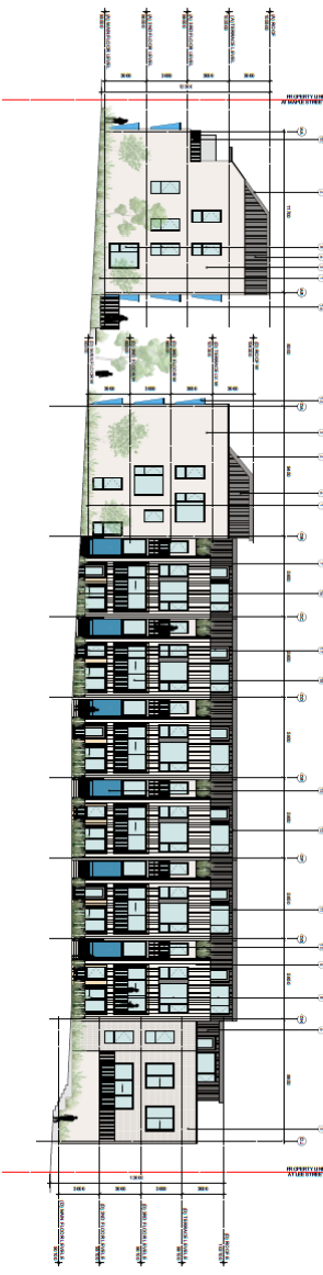
2 SOUTH ELEVATION (AT CENTRAL AMENITY AREA)