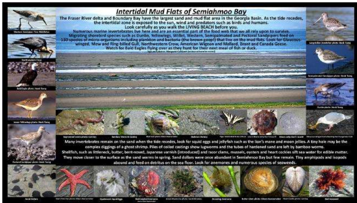
Example of 2012 Sign Series

When Memorial Park was renovated in 2016 the signs were removed with assurance to Friends of Semiahmoo Bay Society that they would be re-installed when the renovation was complete. Following the renovation, City staff decided that the sign series would benefit from a visual refresh, and Council directed that the signs should be installed on the Pier rather than at the top of the stairs so as not to impede the views of patrons from the adjacent restaurants.