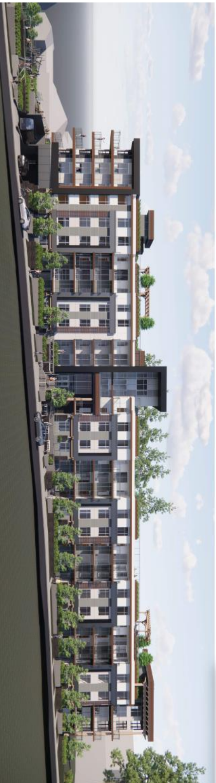
east perspective elevation