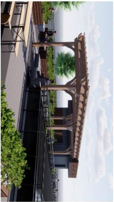
roof deck - trellis seating area & picnic area