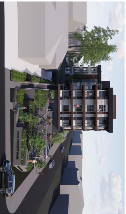
south perspective elevation