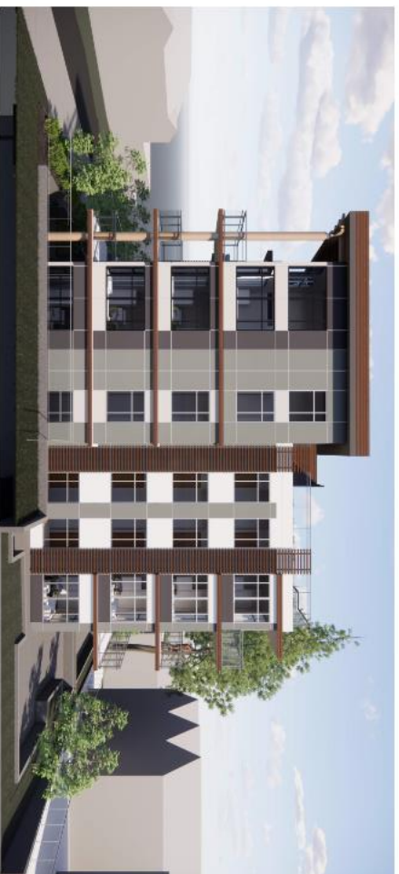
north perspective elevation