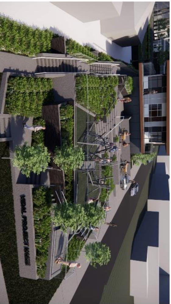
ground level greenspace - aerial view