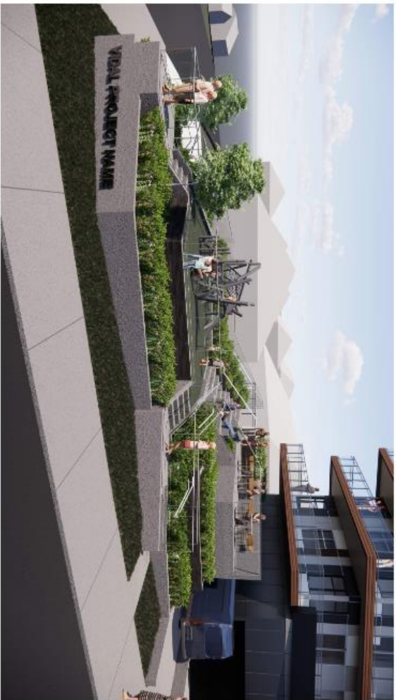
ground level greenspace - street view