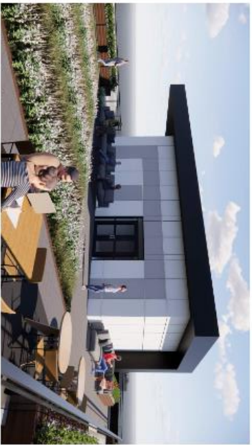
roof deck - plaza & elevator lobby