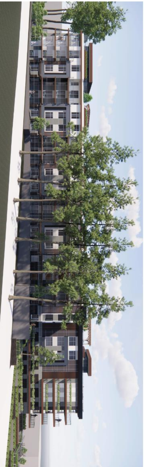
west perspective elevation