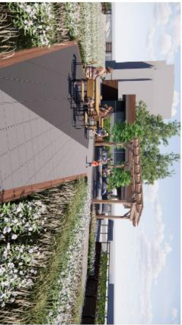
roof deck - green roof & plaza