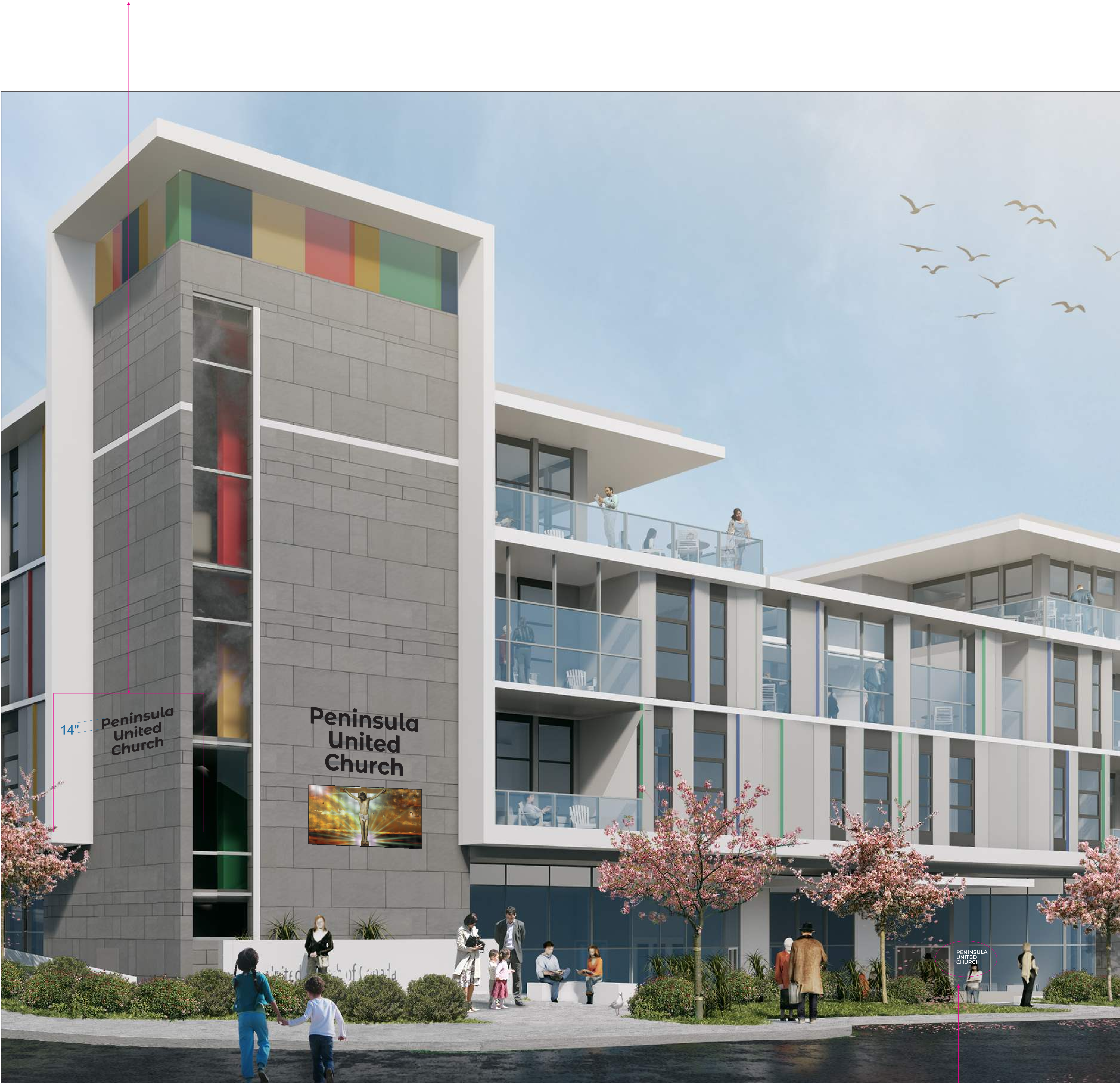
Peninsula United Church

Illuminated Channel Letters: 3" deep face lit channel letters and shape. Face to have translucent vinyl. Internal white LED light source. To be mounted flush to bulkhead with #10 tek