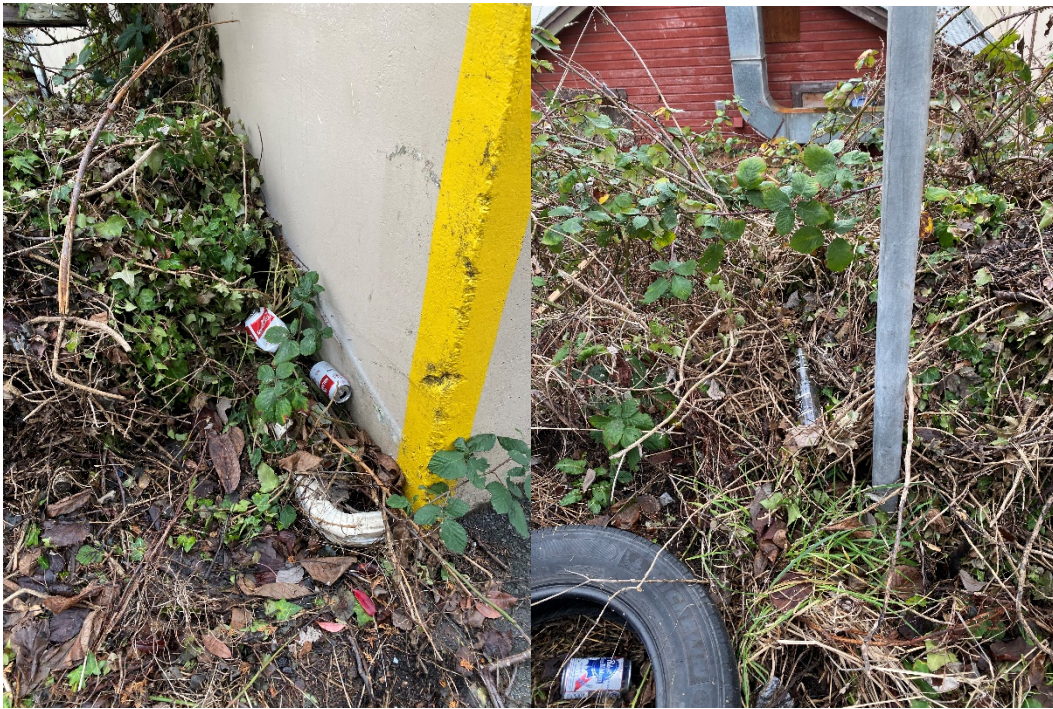
Litter and empty beer cans/bottles found on Marine Lane