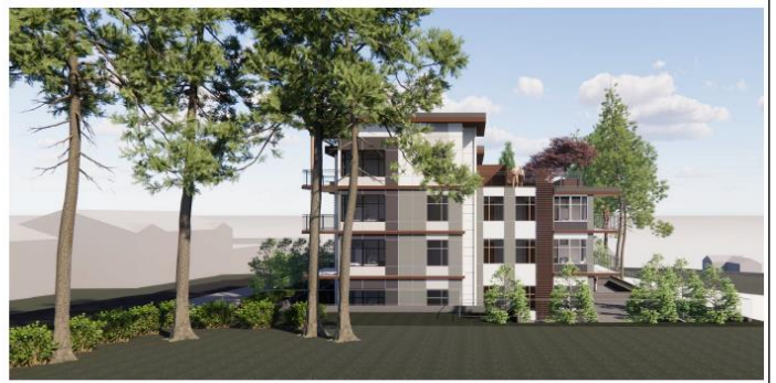
north perspective elevation