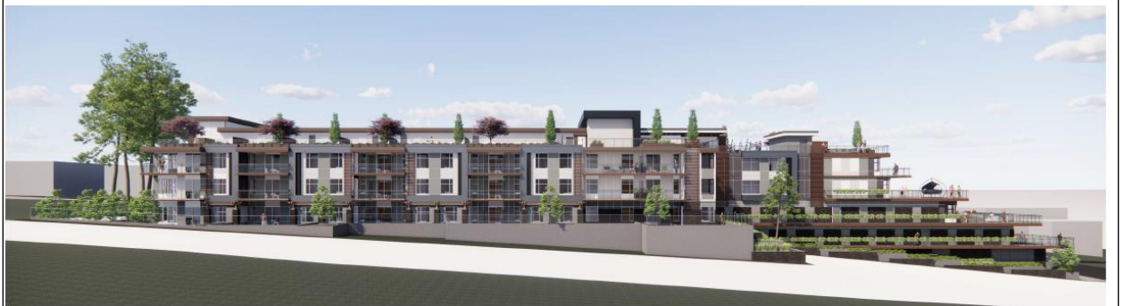
west perspective elevation