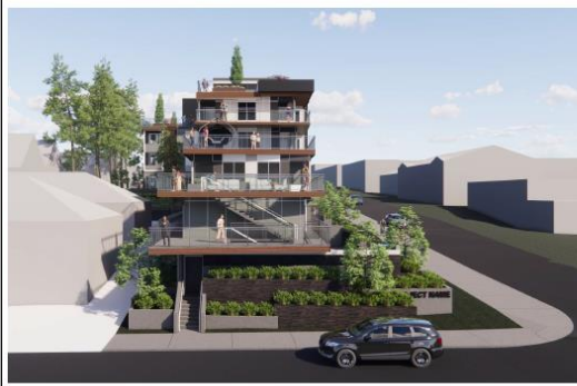
south perspective elevation