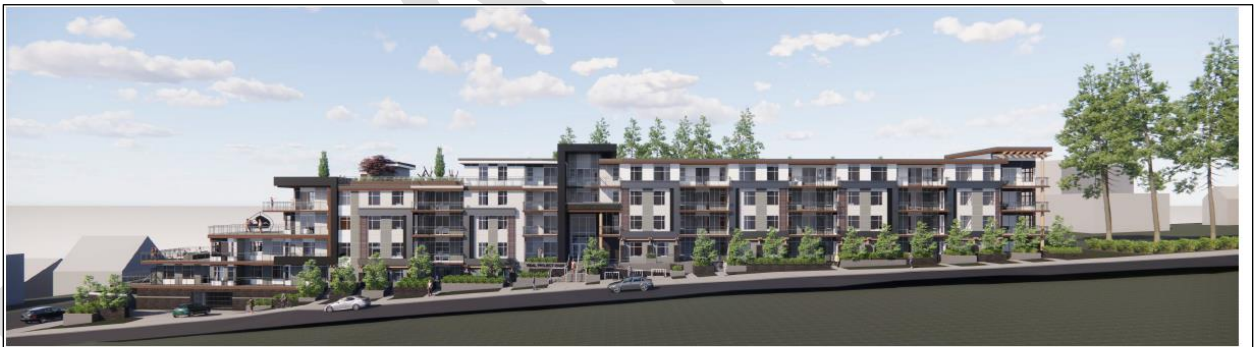
east perspective elevation