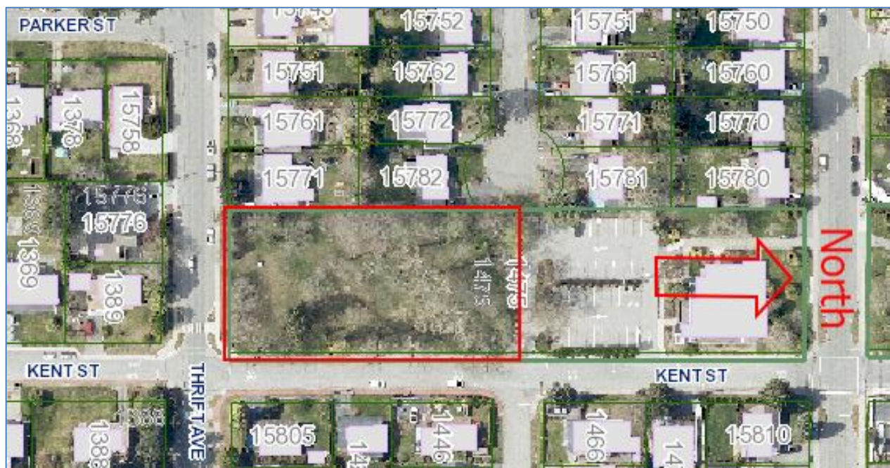
Figure 1. Project Area Map

Maccaud Park is a community park with approximately 1.2 hectares of greenspace, containing 11 different tree species, and totaling 80 trees at the south end. The park is located on Kent Street, between Thrift Avenue and North Bluff Road, and was originally sold to the City in 1968. The project area is located at Maccaud Park south (refer to Figure 1).