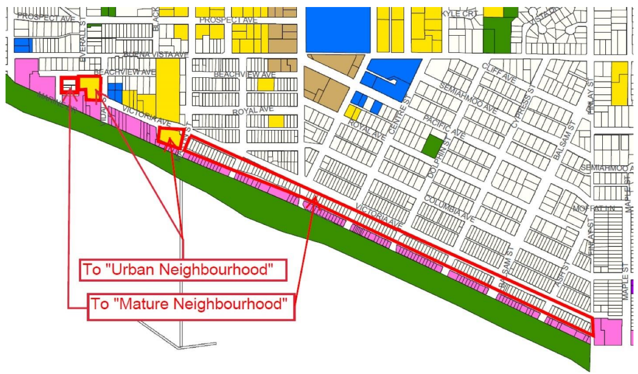
Image 5 – Proposed Land Use Designation Changes from Waterfront Village Designation

Several Elm Street property owners have provided correspondence to the City noting their opposition to being removed from the Waterfront Village designation and being designated as Mature Neighbourhood. This correspondence is attached to this report as Appendix D. As noted above, the proposed OCP amendment bylaw has been drafted as directed by Land Use and Planning Committee, however, as an alternative to the Mature Neighbourhood designation for Elm Street (which would allow redevelopment as single family, duplex, or triplex homes), should Council wish to continue to allow multi-family development on these properties, in the Options section of this report it is noted that the draft bylaw could be amended by Council resolution prior to first reading.