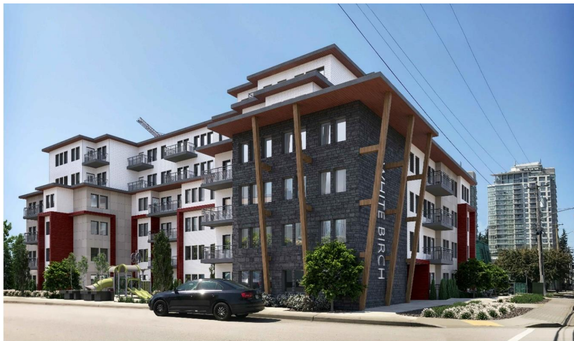
Figure 2: Rendering of the Proposal from the corner of Russell Avenue and Fir Street Looking Southwest

The applicant has submitted a response to the Multi-Family Development Permit Area Guidelines, which are applicable to the proposal pursuant to OCP Policy 22.1. The response to the guidelines is attached as Appendix G. Staff consider the submitted response to be in conformance with the Development Permit Guidelines. Figure 2 below provides a rendering of the current proposal, the form and character of which remains largely the same as the previous proposal considered in the report dated September 30, 2019.