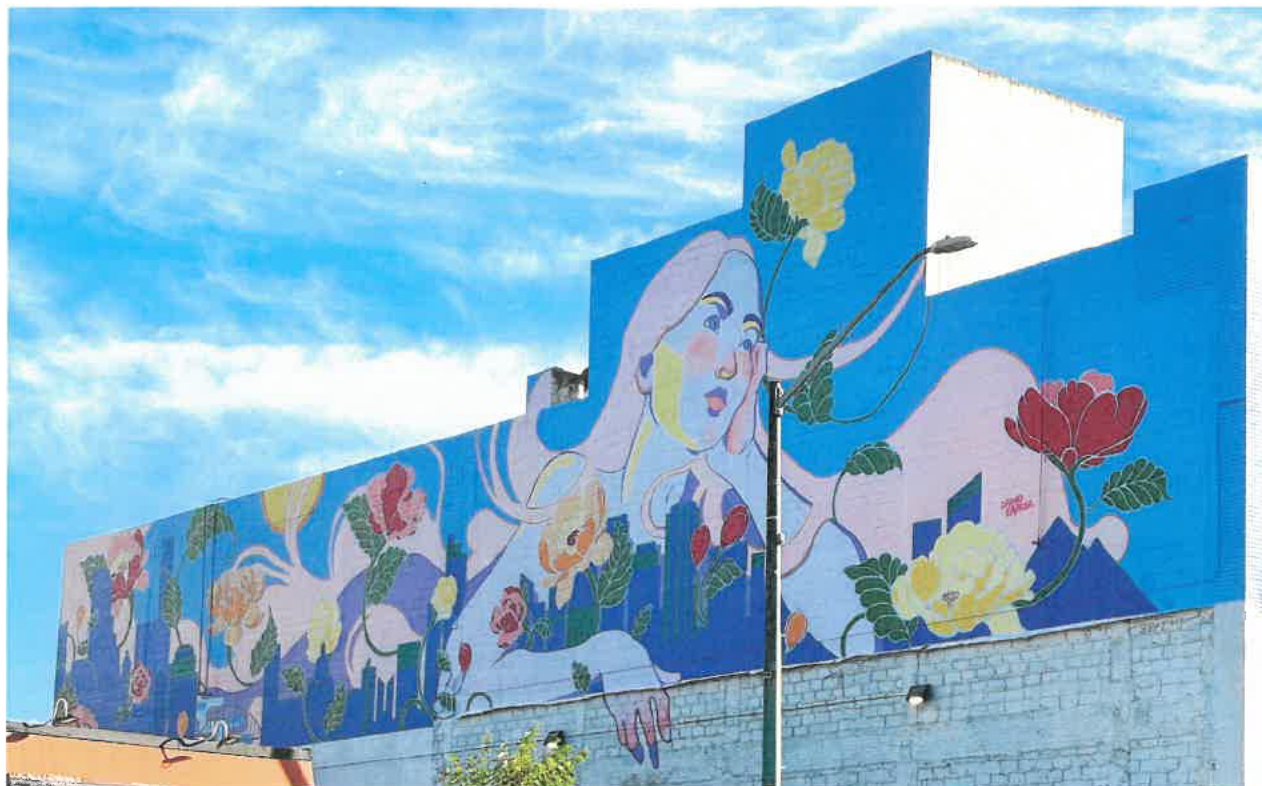
"Dreamer", 2024, Edmonton AB, Latex Paint, 120ft x 25ft