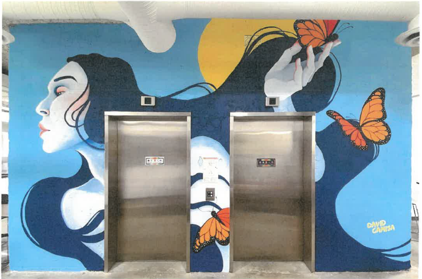
"Free", 2021, Vancouver BC, Latex Paint, 18ft x 14ft