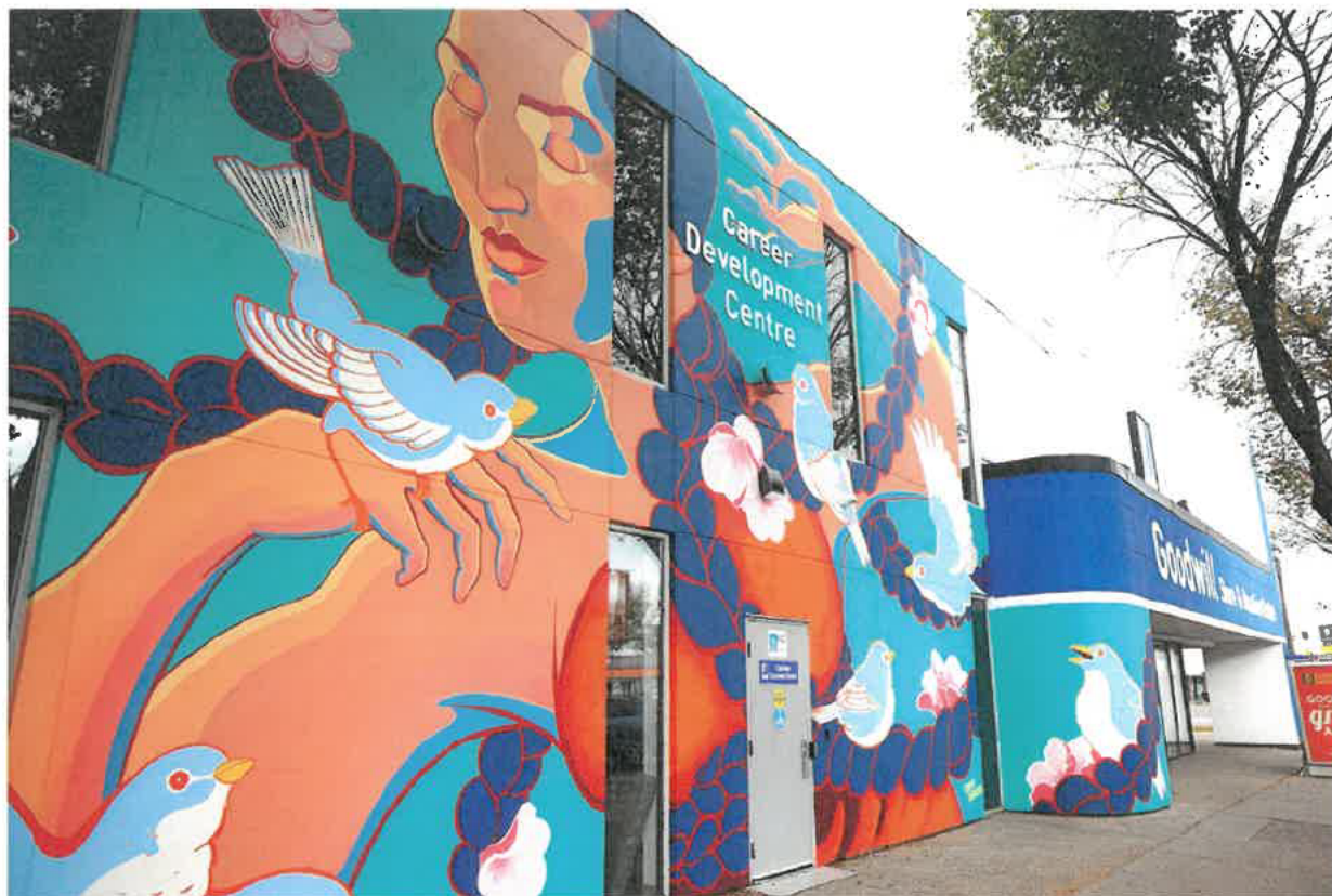
"Nest", 2023, Edmonton AB, Latex Paint, 48ft x 25ft