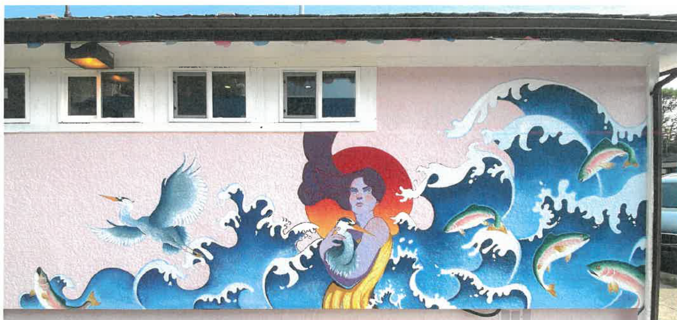
"Rise Up", 2022, Salt Spring Island BC, Latex Paint, 42ft x 10ft