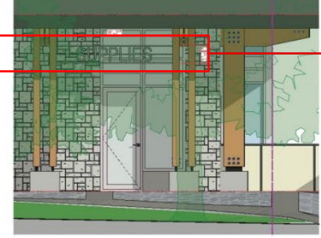
DETAIL ELEVATION - SOUTH COMMERCIAL SUITE SCALE: 3/8" = 1'-0"