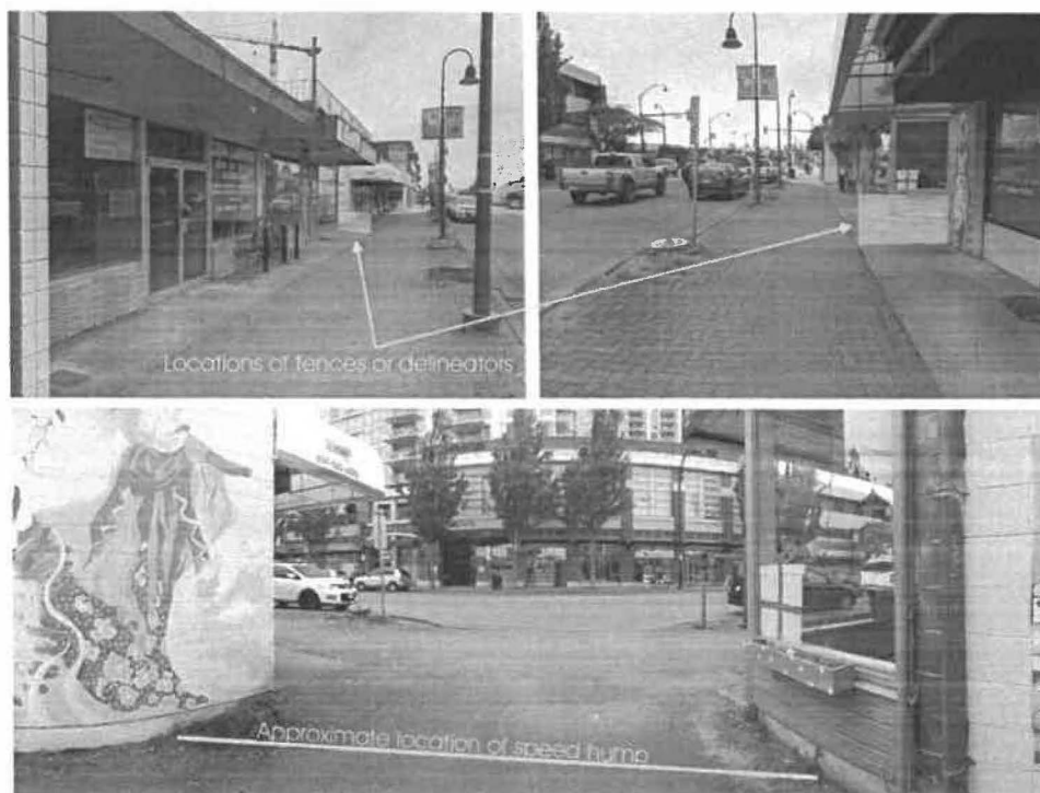
FIGURE 2 PROPOSED LOCATION OF THE FENCES/DELINEATORS AND SPEED HUMP

FIGURE 2 illustrated the proposed locations of the fences/delineators and speed hump